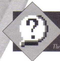
The "Ask" Icon

To use the "Ask" icon, select it the same way you would select any other icon -- with the mouse, the TAB key, or the joystick. The cursor will then change to the "Ask" cursor. Click the "Ask" cursor on any character (other than yourself!) in the scene. A closeup of the Notebook will appear.